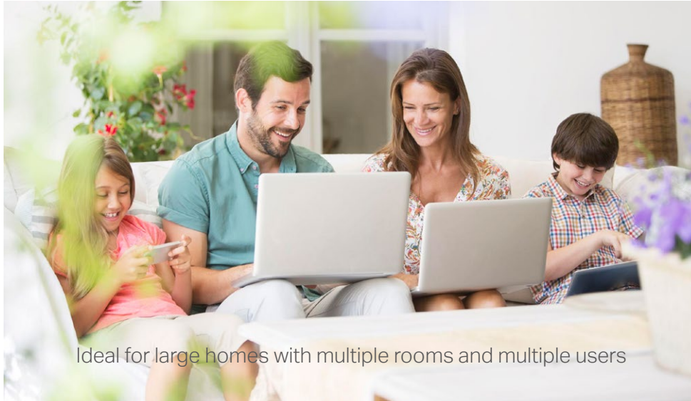
Ideal for large homes with multiple rooms and multiple users