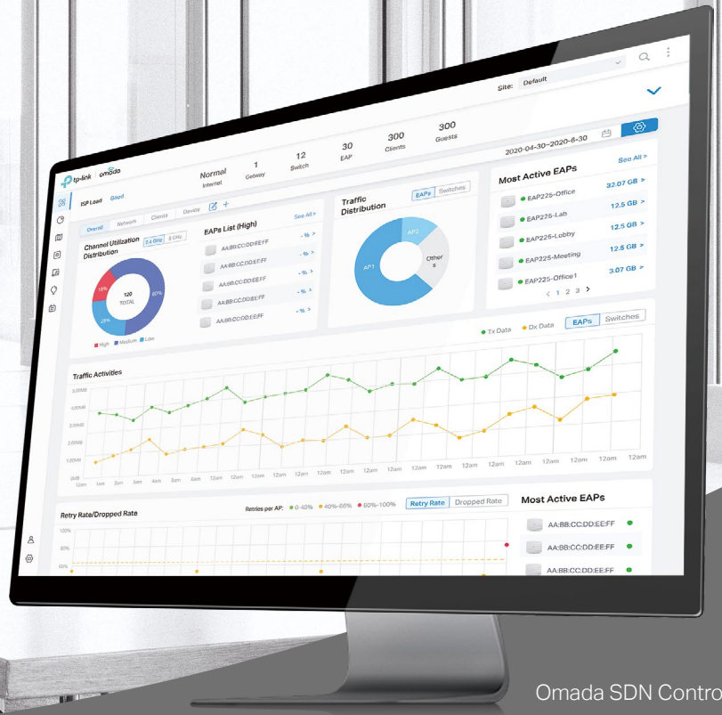
Omada SDN Controller